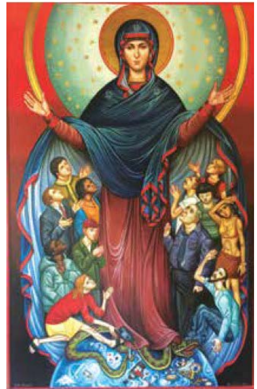
Our Lady of Recovery